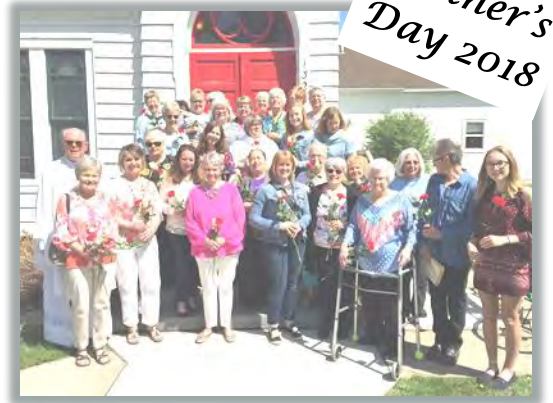
Mother's Day 2018