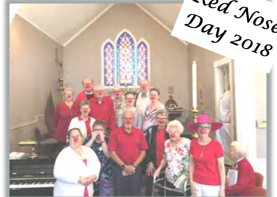
Red Nose Day 2018