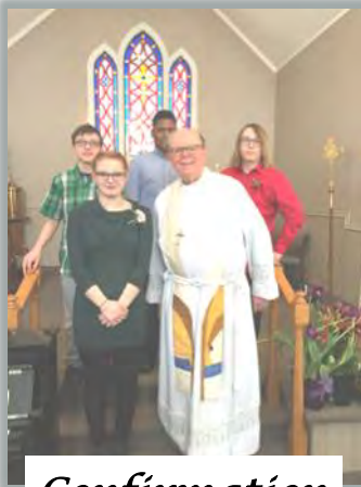
Confirmation Day 2018