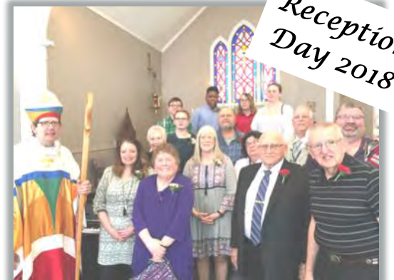
Reception Day 2018