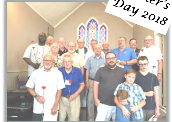
Father's Day 2018